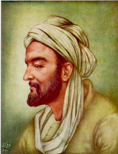
AVICENNA (980-1037 AD)